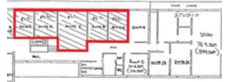
FIRST FLOOR PLAN 611 DEAN STREET ALBURY. 1:100